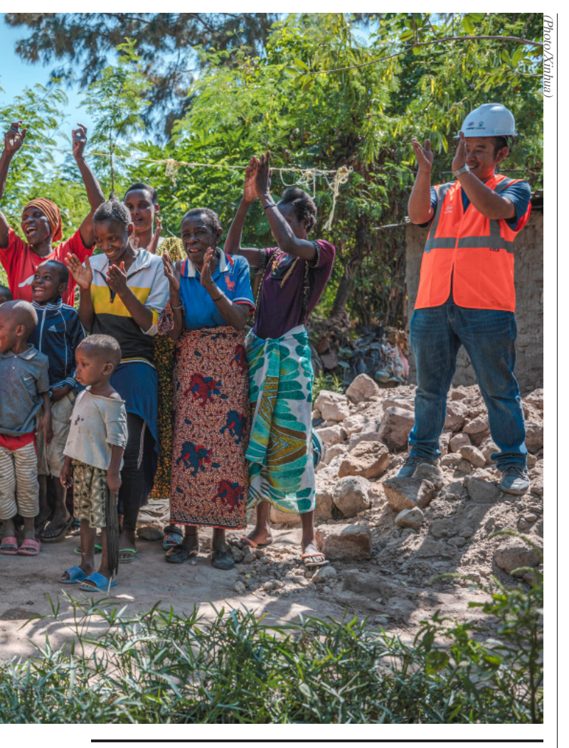
The Mwanza Satellite City water supply project in Tanzania is an important livelihood project under the China-Africa Belt and Road Initiative.

funded by China's state loans would be unsustainable. The limited-scale trade between Africa and China and the long-standing trade deficit are not conducive to sustainable Belt and Road cooperation. The current situation of China-Africa trade is essentially hampered by the backward industry status and structural problems of the African countries, and may easily trigger nationalism in some of the African countries, and even resistance to investment, products and technology from China.