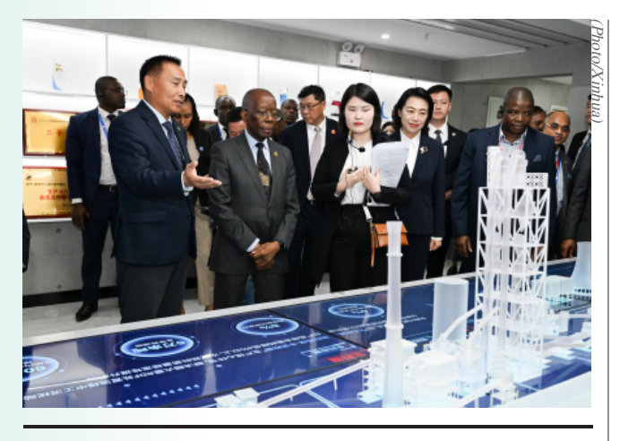
On October 20, 2023, Mozambique's Prime Minister Maleane (front second left) visits Huaxin Cement Co. in Wuhan.

stage. As the development demands of the African continent are highly complementary to the Belt and Road Initiative, African countries and China have both gained development opportunities in Belt and Road cooperation. In October 2023, the 3rd Belt and Road Forum for International Cooperation was held in Beijing, with the theme of "High-quality Belt and Road Cooperation: Together for Common Development and Prosperity". President Xi Jinping announced eight steps by China to support high-quality Belt and Road cooperation, including building a multi-dimensional Belt and Road connectivity network, supporting an open world economy, carrying out practical cooperation, promoting green development, advancing scientific and technological innovation, supporting people-to-people exchanges, promoting integrity-based Belt and Road cooperation and strengthening institutional building for international Belt and Road cooperation. From the perspective of the achievements, Belt and Road cooperation between Africa and China has been fruitful, which has laid a solid foundation for building a China-Africa community with a shared future. Gearing up China-Africa Belt and Road cooperation for a stage of high-quality development is in the interest of both parties for economic upgrade.