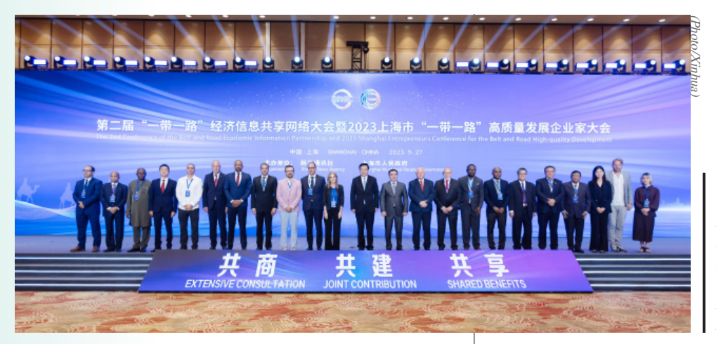
On September 27, 2023, the Second Conference of the Belt and Road Economic Information Partnership and 2023 Shanghai Entrepreneurs Conference for the Belt and Road High-quality Development kicked off in Shanghai.

oration in infrastructure construction, food supply and manufacturing development. Efforts need to be made to improve the empowerment of science, technology and digital technology, develop green eco-agriculture and high value-added manufacturing, and achieve a high degree of integration of infrastructure projects with the local industries.